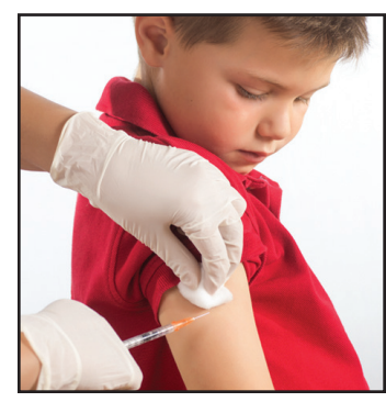
With immunotherapy, small doses of allergen administered over a period of time are used to relieve or eliminate the patient's allergy symptoms.

Immunotherapy does not provide immediate relief of allergy symptoms. Over a period of time, however, it can help eliminate allergic symptoms and even lessen the need for asthma medication.